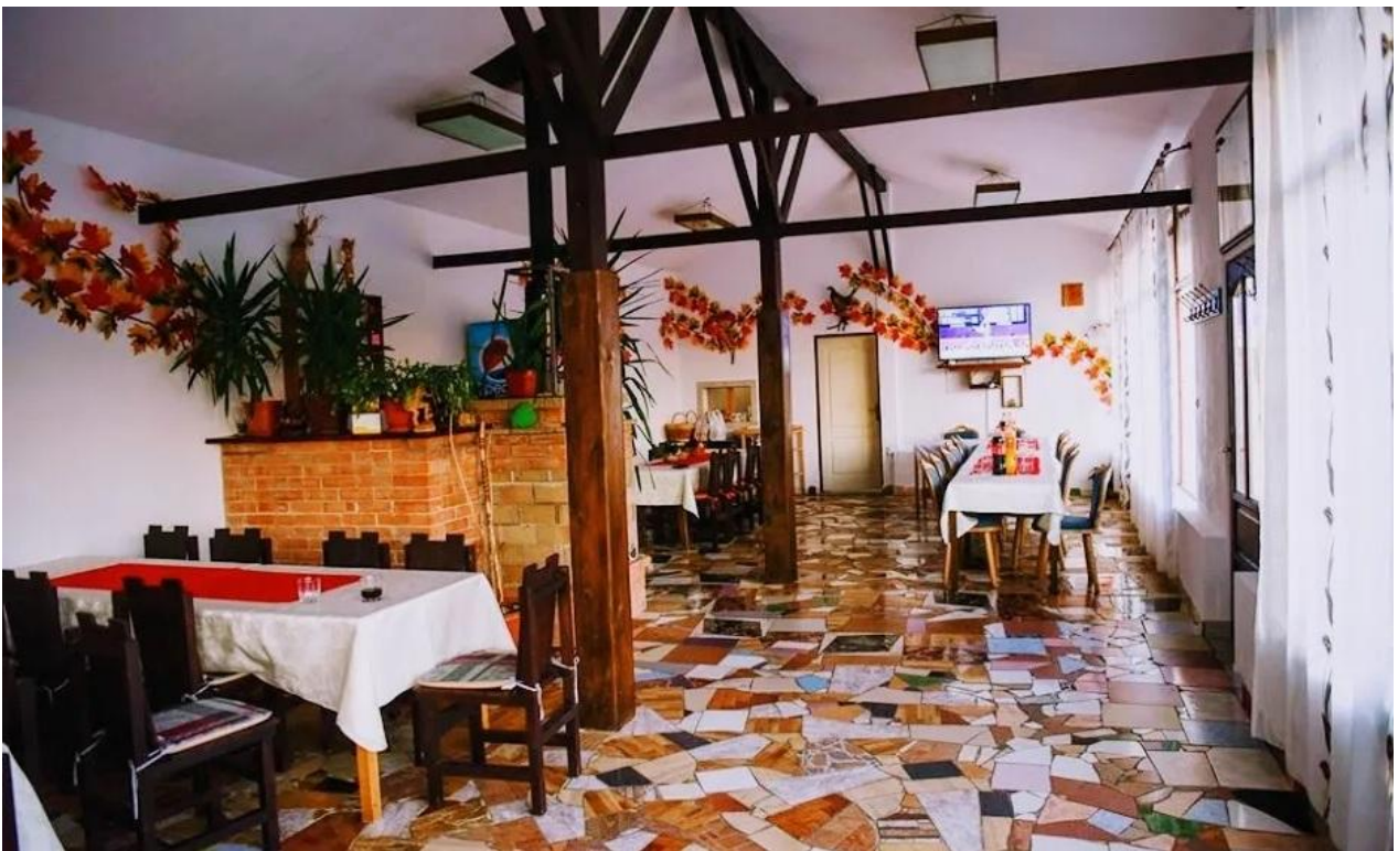
Tulnicul Muntilor Guesthouse - local gastronomic point

The core concept focuses on serving fresh dishes prepared daily using slow-food methods. Made with raw ingredients sourced directly from their own households or nearby local producers, these meals offer an authentic, sustainable taste of Albac's rich cultural heritage.